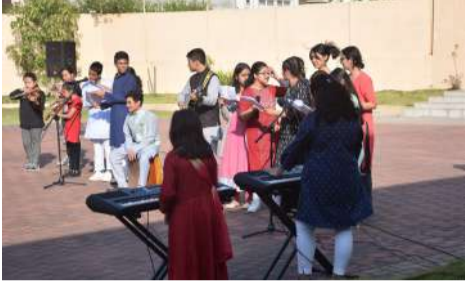
Students performing Deusi Bhailo during Tihar Celebration.