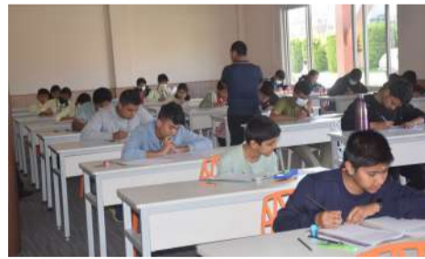
Students from various schools participating 9th edition of Iranian Geometry Olympiad at IWS.