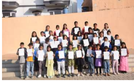
Students being conferred with the Students of the month certificates.