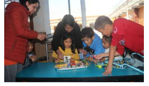
Grade III executing IPC tasks.