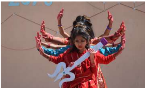
Students of grade I performing a Nawadurga dance.