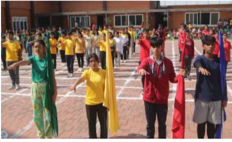
Oath taking ceremony and sports week 2079 inaugural.