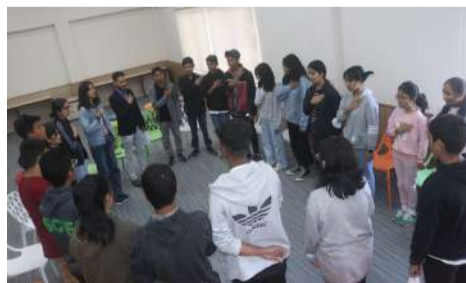
Member of IWS Student council singing the national anthem before a regular meeting.