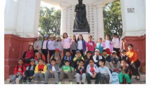
Students of grade II on a field trip to Central zoo Jawalakhali.