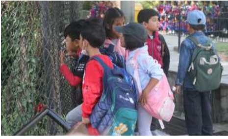
Students observing the animals at the Central Zoo.