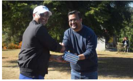
Winner of musical chair competition.