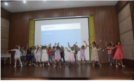
Grade I IPC exit point performance.