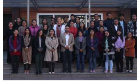
IWS teachers after attending a one day intensive Non-Violence Communication training.