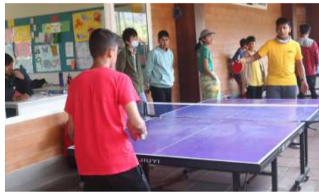
Games and sports at IWS.