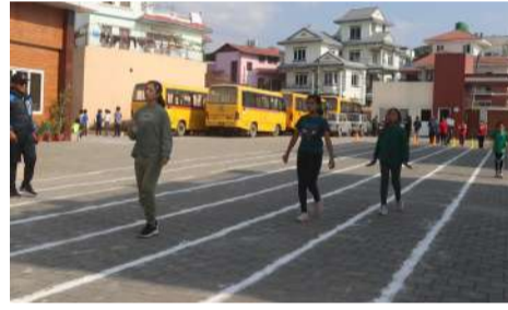
Marble and Spoon race on Sports day.