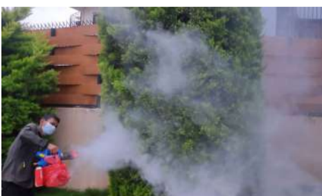
Fumigation against Danguie at IWS premises.