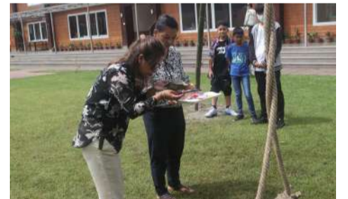
Our Principal Laying the foundation and inaugurating the swing.