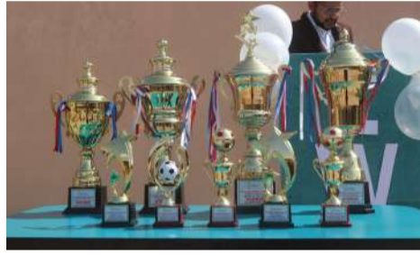
Trophies being distributed on various categories.