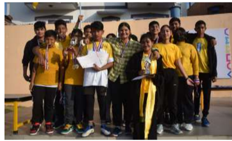
Yellow house with trophy and medals.