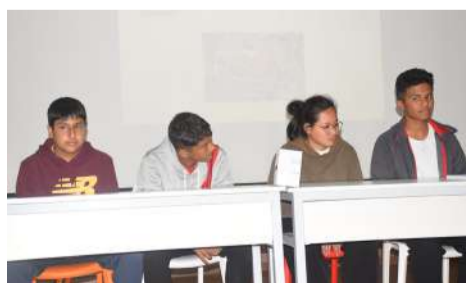
Students being engaged in a discussion.