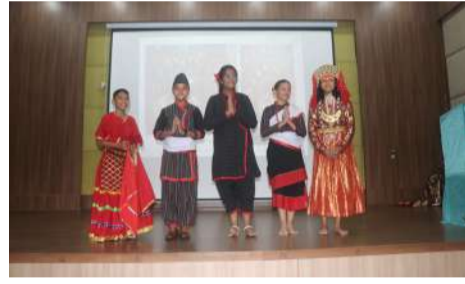
Students representing our rich culture and costumes.