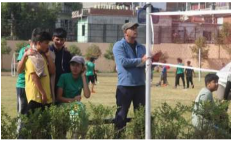
Referee ensuring a fair play on badminton match.