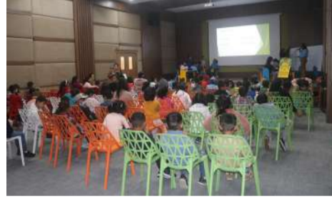
नेपाली हिउजे प्रतियोगितामा सहभागी विद्यार्थीहरू