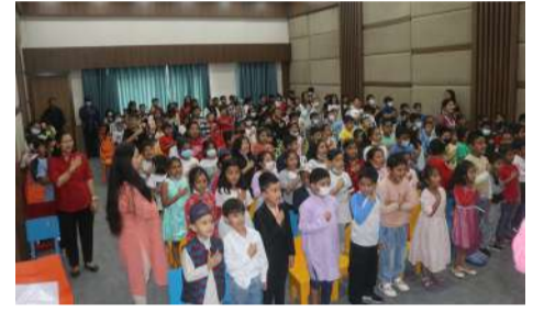
Enthusiastic learner all set to celebrate Children's Day.