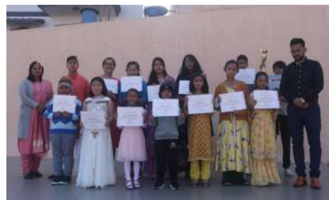
Students being awarded with certificates and medals.