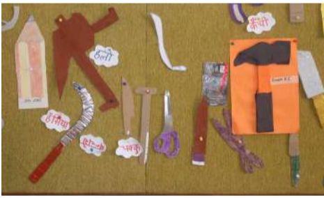
Action based Learning