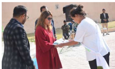
The head girl handing over school's flag.