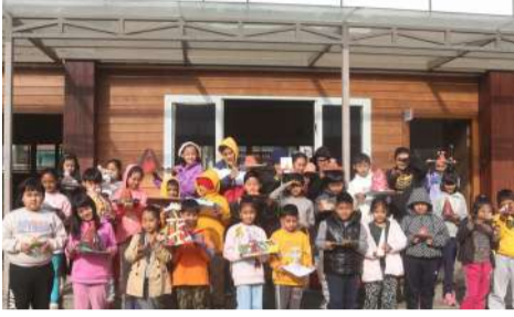
Students of grade II demonstrating the model of volcano.