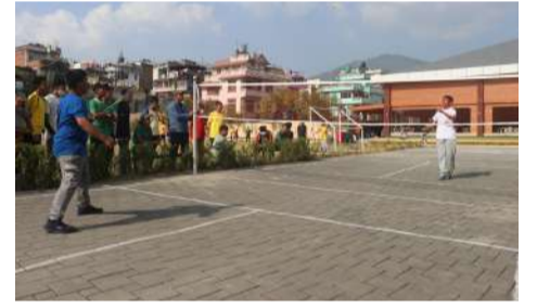
Students competing in badminton competition.