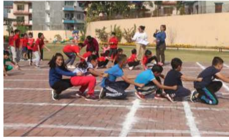
Students playing game during Sports Week 2079.