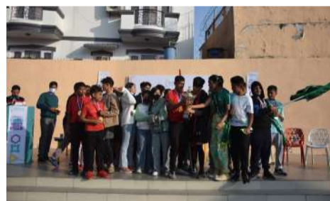
Green house with trophy and medals.