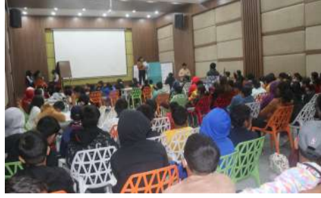
Junior wing participating on the Mathematics Trivia 2019.