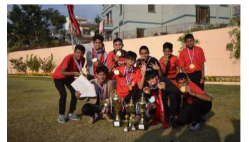
Red house with trophy and medals.