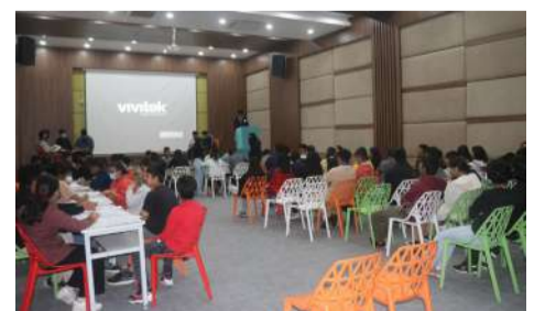
Students participating in Quiz contest.