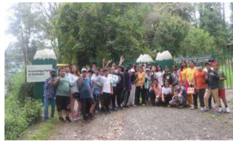
Field trip to ICIMOD.