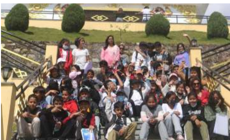
Students on an excursion.