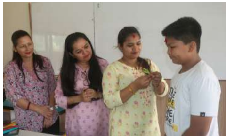
Student receiving Tika and Jamara.