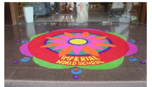
Exquisite Rangoli made during Rangoli competition.