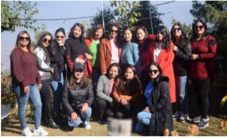
Teachers retreat at Ranikot Resort.