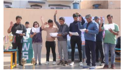
Referees taking the oath before the games.