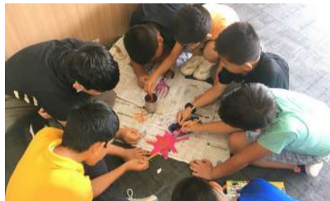
Students of grade V learning by doing the art work on their IPC exit point.