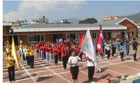
March Past on sports day opening ceremony.