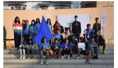
Blue house with trophy and medals.