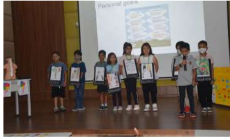
Grade II on IPC exit point.