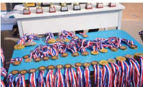
Medals and certificates for Sports day.